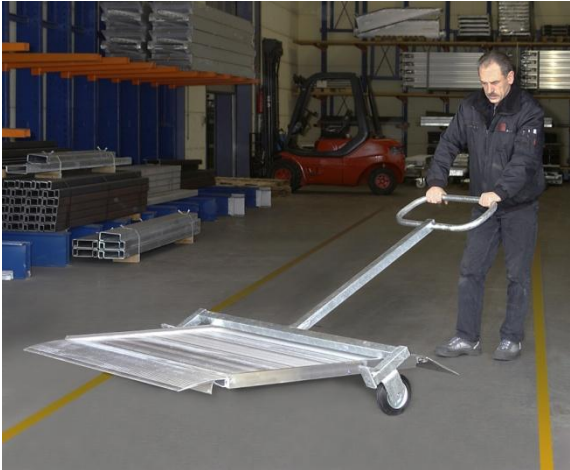
Steel transport trolley