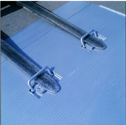
Leveller with retractable fork grips