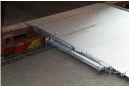
Leveller with safety arms